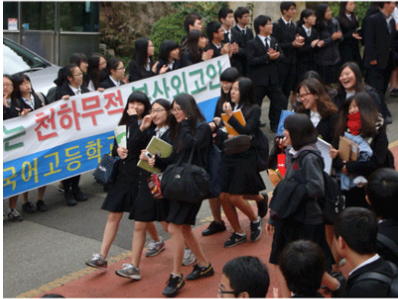
Underclass Students Cheer the Seniors on the Day before the Big Exam.