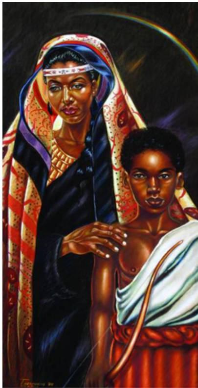
Hagar and Ishmael